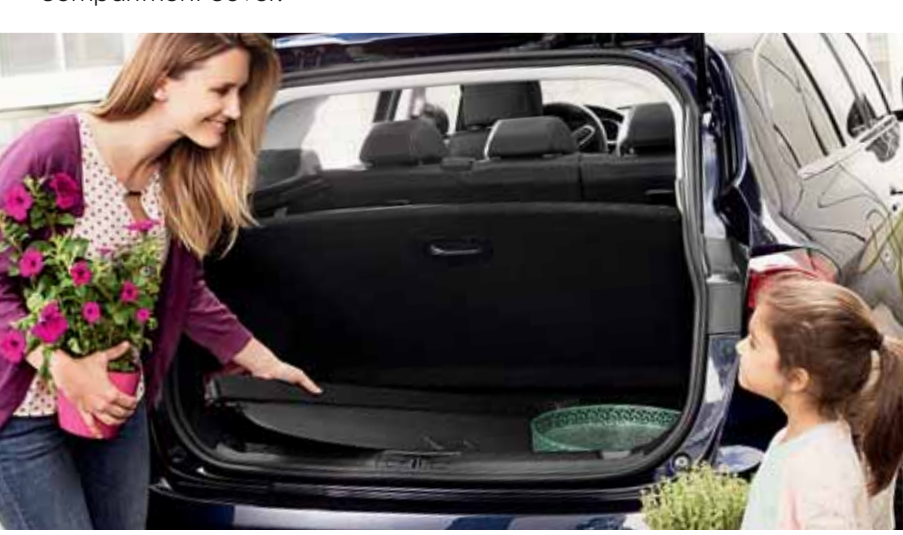
The luggage compartment cover can easily be placed in the Magic Cargo Space.