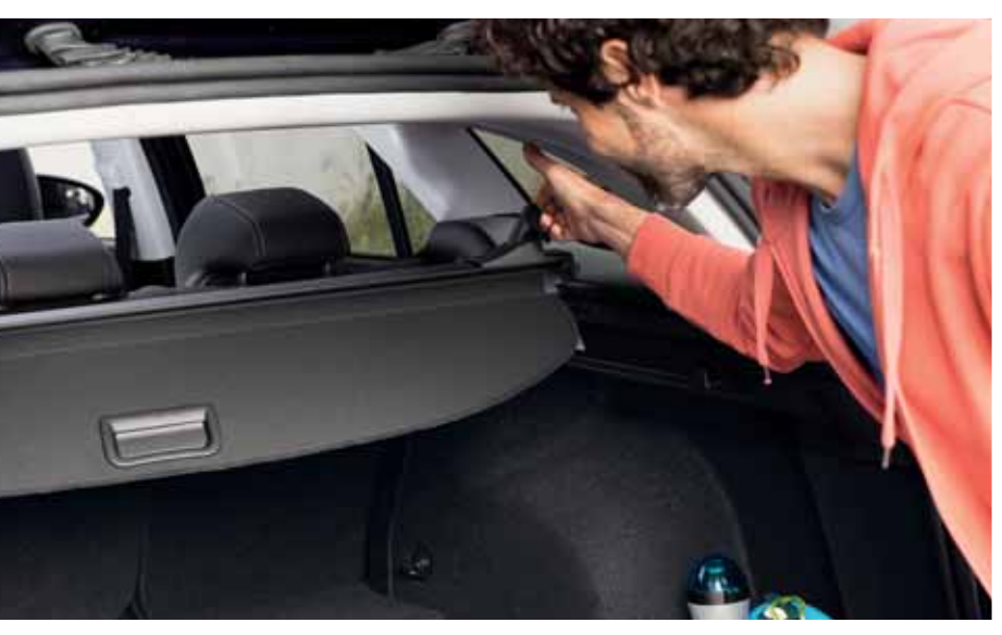
With just one hand, you can easily remove the luggage compartment cover.