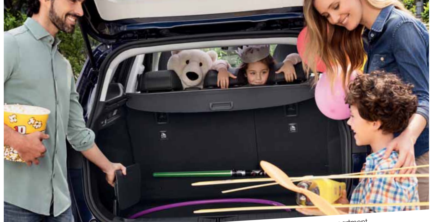
increasing the width of the luggage compartment.