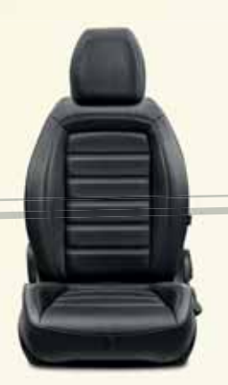
LOUNGE Techno leather (optional) Code 404