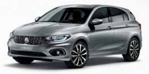
612 MINIMAL GREY METALLIC