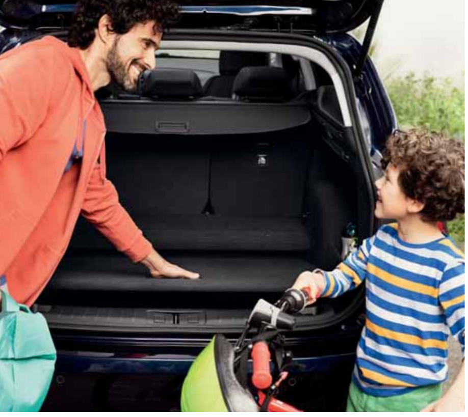
You can increase the height of the luggage compartment by positioning the Magic Cargo Space to the lowest level, using only one hand.