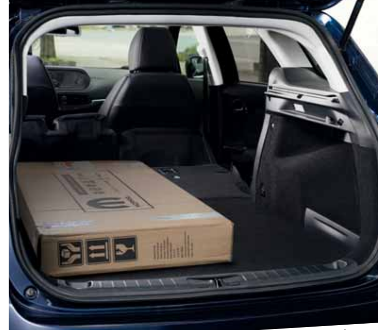
Flipping and folding the back seats can increase the load compartment to a length of 1800 mm with a flat and continuous surface.